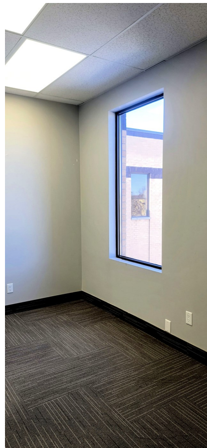
G216 - 1,338 sq ft